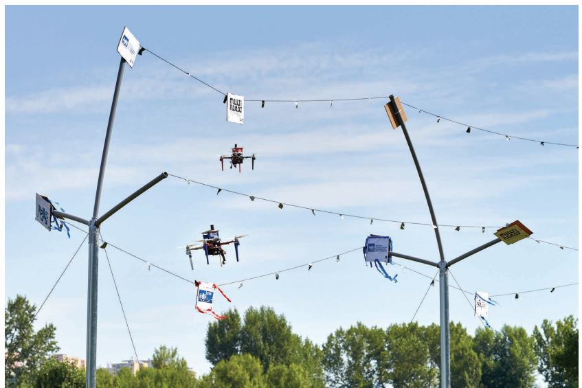
FIGURE 2. The outdoor field experiment with unmanned aerial vehicles (UAVs) performing an inspection task.

One of the main goals of the summer school is to enrich the participants with the knowledge and skills necessary to put ideas into practice. The 2022 practical session focused on a power line inspection task inspired by the Aerial-Core project ( https://aerial-core.eu/ ) (Figures 2 and 3). The task was designed as a competition where a fleet of unmanned aerial vehicles (UAVs) was required to visit several target regions (locations for inspection around a power line). The competition was organized in two parts: first, the participants were asked to design, develop, and test their solutions in the Gazebo robotic simulator using the MRS UAV system ( https://github.com/ctu-mrs/mrs_uav_system ) as a framework; second, the participants deployed their solutions in outdoor field experiments using MRS UAV platforms. The results were provided in real time (Figures 4 and 5). The competition required participants