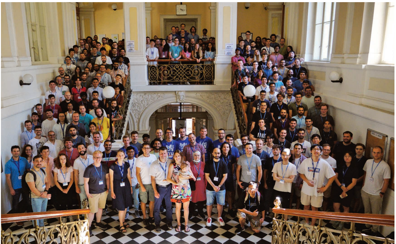
FIGURE 1. The participants and lecturers during the 2022 session of the summer school.

Digital Object Identifier 10.1109/MRA.2023.3238213 Date of current version: 22 March 2023