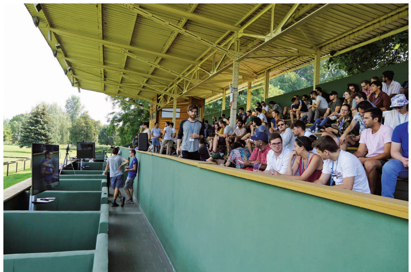
FIGURE 4. The participants attending outdoor experiments.